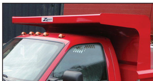
Integrated \frac{3}{4} Cab Shield