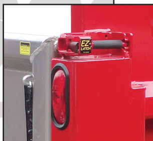
E-Z latch with oval-shaped stop/turn/tail light