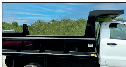
Integrated \frac{3}{4} Cab Shield