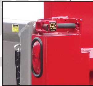
E-Z latch with oval-shaped stop/turn/tail light