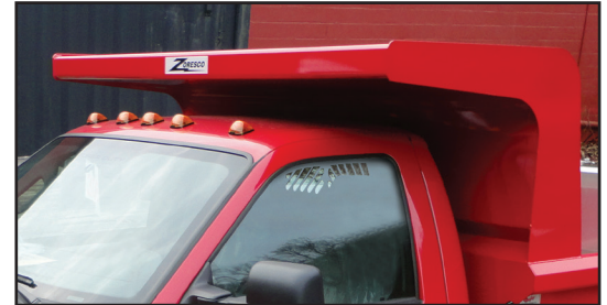
Integrated \frac{3}{4} Cab Shield